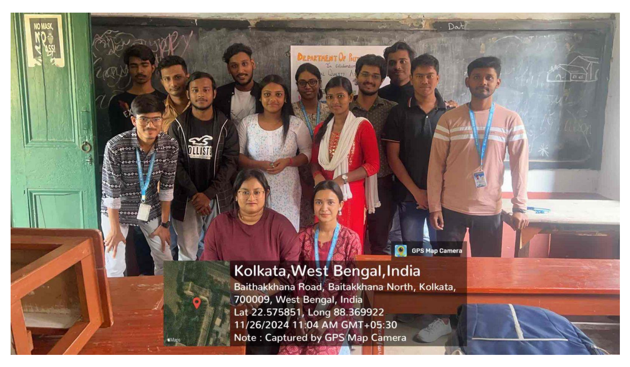
The students of the Department of Political Science observing Constitution Day on 26<sup>th</sup> November 2024.