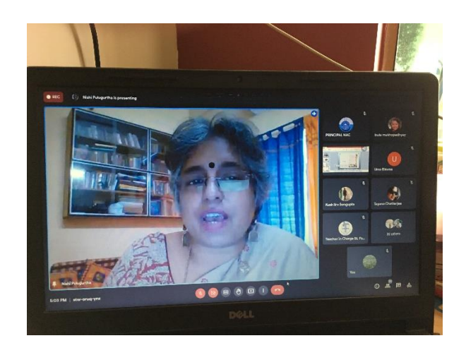
An illustration of the web lecture series held in July 2021co-hosted by both institutions