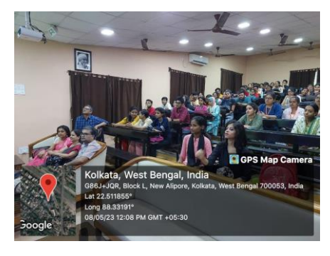
Students' Seminar at New Alipore College (08/05/2023) with our students

We would like to project the participation of students from both institutions in academic programmes like Seminars, as examples of Student Exchange Programmes. Such exchange among young minds not only improve their competitive spirit, but also act as incubation centers for new ideas and fosters a spirit of healthy academic exchange.