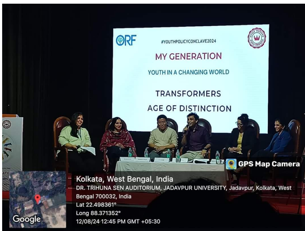
The Chief Guests at the panel discussion on policy requirements