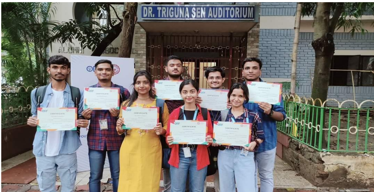
Student delegates from the Department of Political Science, SPCMC at the Youth Policy Conclave