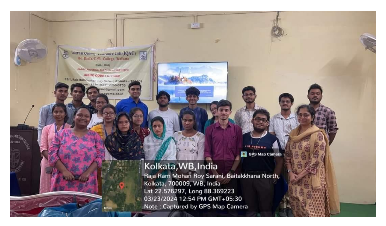
Staff and the students of various Departments of the college participating in the workshop with the delegates of the Jadavpur University Debating Society (JUDS)