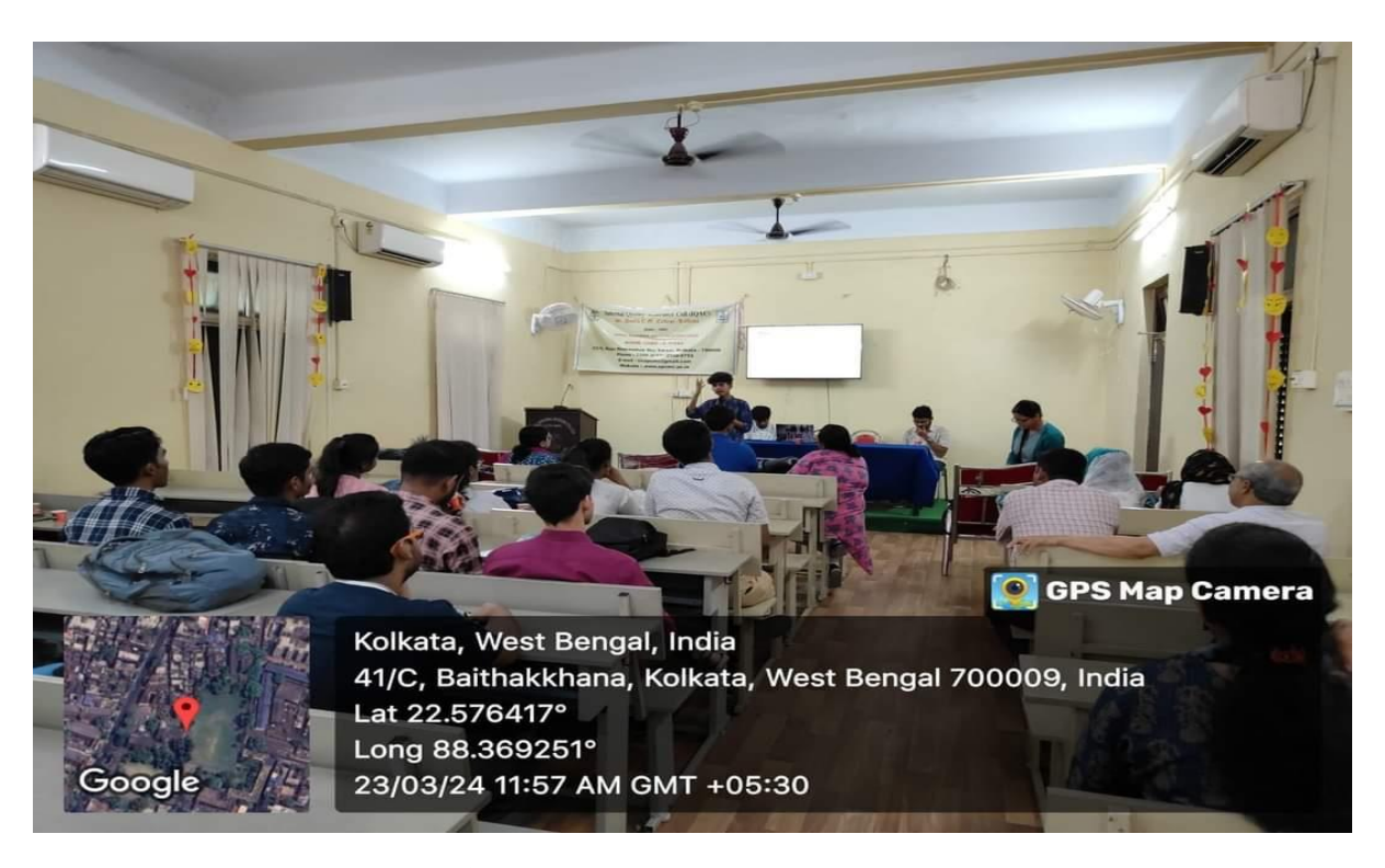
Diptesh Banerjee of JUDS delivering a presentation on the rules and procedure to participate in a MUN