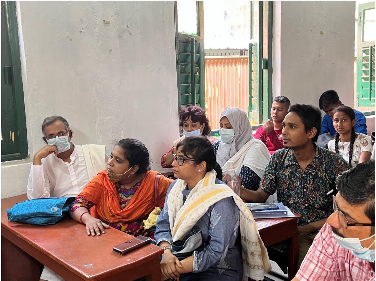
All the esteemed guests of the seminar.